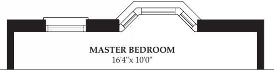
SECOND FLOOR PARTIAL PLAN - REAR (As Required)